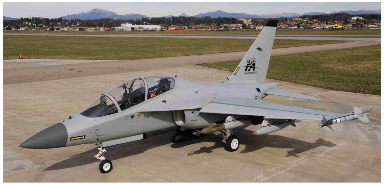
The first pre-series test airframe of weaponized M-346FA at the Venegono plant

On 8 April, the Federal Department of Defence, Civil Protection, and Sport and the Armasuisse defence procurement agency began in-country evaluations at Payerne airbase of the Eurofighter Typhoon T3, Rafale F4, F-18E/F Super Hornet, and F-35A Lightning II to replace F-5E and F/A-18C/D fighters with a single type with a full operational capability in 2030. Armasuisse recommended that the Gripen E not participate. An assessment report and final vote in the National Council is planned for 20 December, triggering the countdown to the mandatory referendum the SP is counting on.