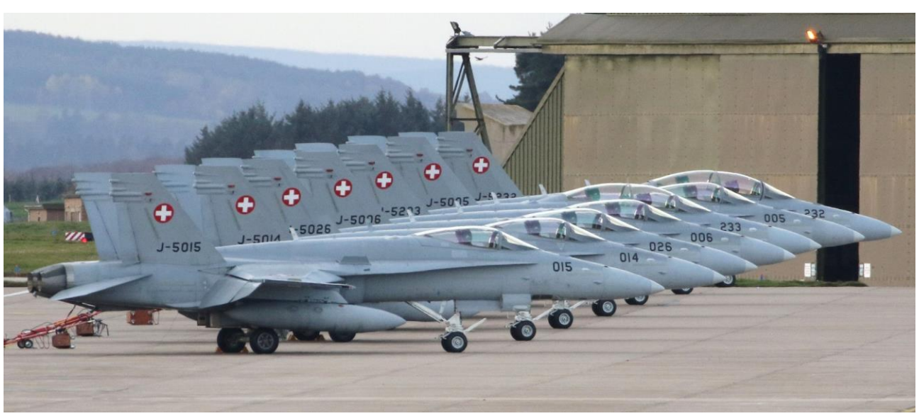
Line-up of Swiss-AF F/A-18C- and D-models. Cracks recently found in it's flaps area made the Swiss AF to on short notice cancel the popular 2019 ,Axalp'-demostration public event.